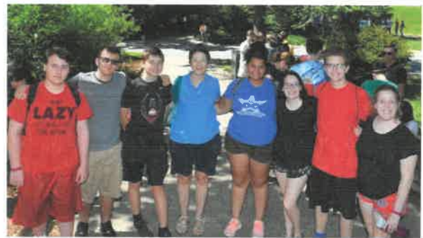
High School at Montreat