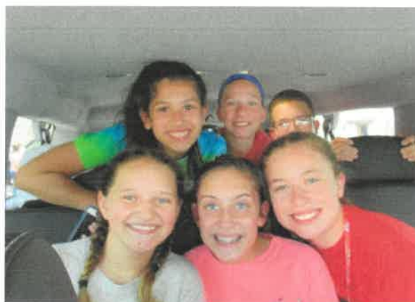
Middle School Mission Trip Sandusky OH