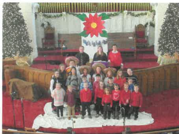
Flower of the Holy Night Christmas Musical