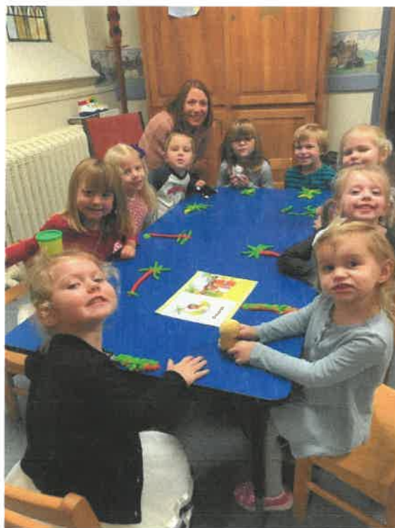
Preschool Sunday School